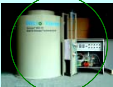
EcoMem™ MBR Compact plant shipped to South East Asia, Mid. East and Latin America.